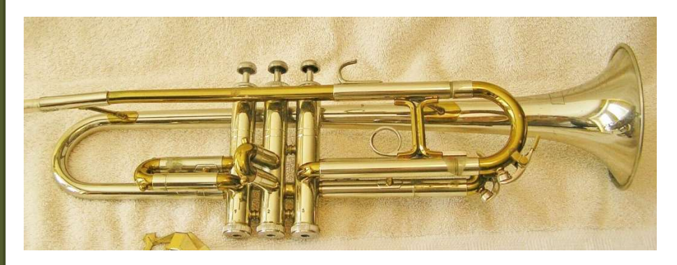
Sistek Music Co trumpet #54052, New Wonder.